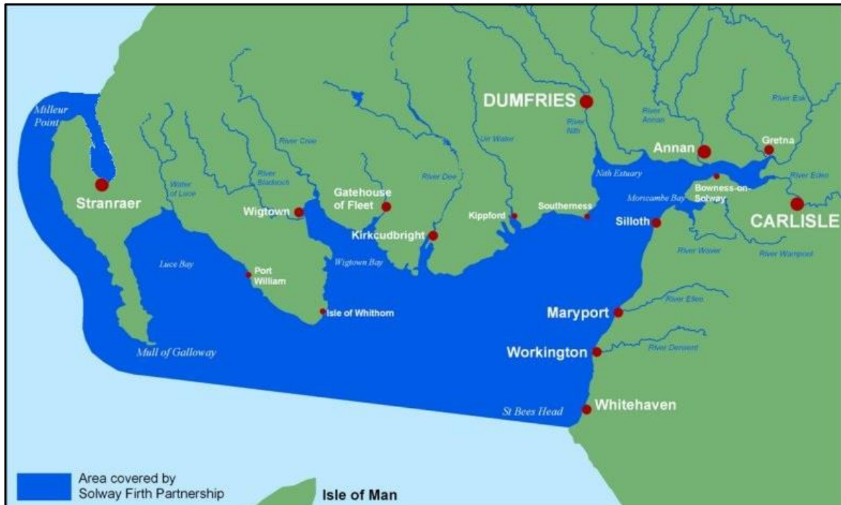
Figure 1 Geographical Extent of the Solway Biosecurity Plan 6

The area covered by this plan is consistent with that of the Solway Firth Partnership (Fig 1).