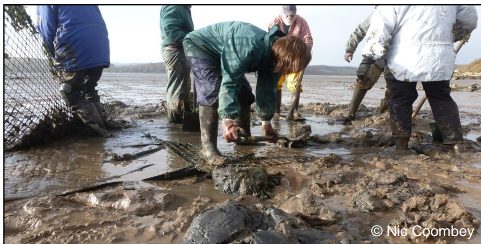
Figure 5: Spartina anglica removal by volunteers at Rockcliffe on the North Solway

Recording and Removal work was carried out by volunteers and students of the University of Glasgow, Dumfries Campus (Figure 4).