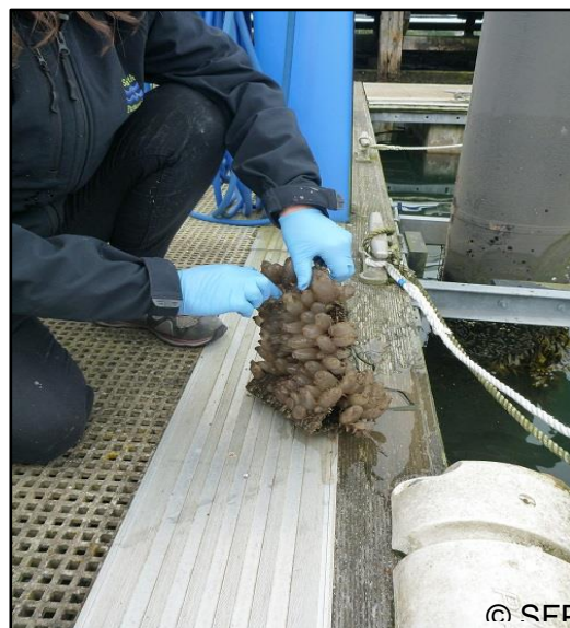
Figure 2: Checking a settlement panel in Stranraer Marina, Sept 2019