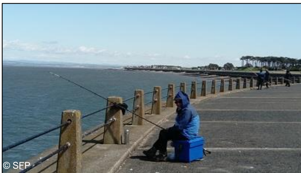
Figure 4: Sea angling at Silloth, Cumbria

There are several locally based sailing clubs in the Solway with good marina facilities at Whitehaven, Maryport and Stranraer and pontoons at Kippford and Kirkcudbright. Most sailing activity is restricted to within 5 km of the coast and the most popular trans-Solway route is between Maryport and Kippford. Boating is highly seasonal, with most activity taking place between May and September, although there is some sailing year-round.