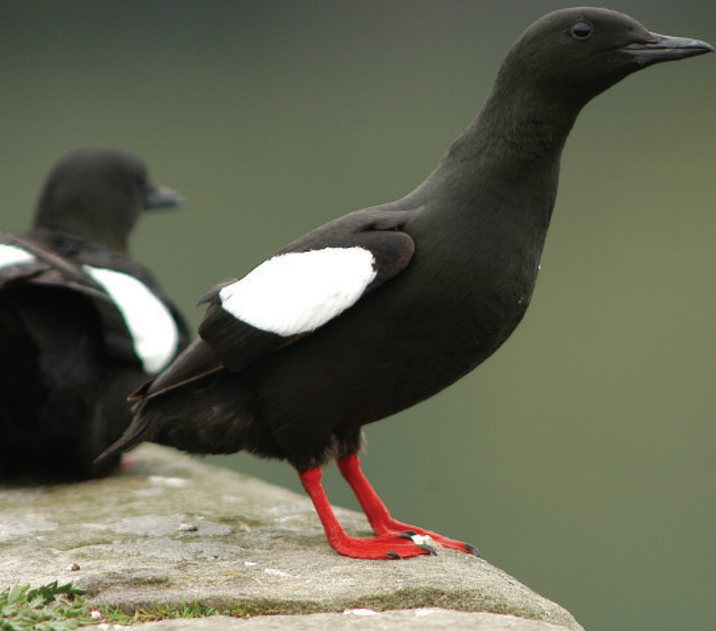
Black Guillemot Keith Kirk