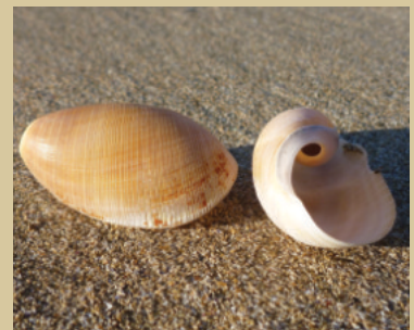
Woody canoe-bubble shell

A bright green beetle that quickly runs about looking for insects to eat.