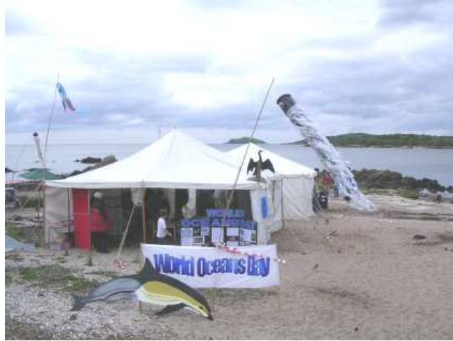
World Oceans Day Celebration marquees on the beach at Rockcliffe