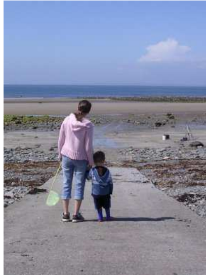
Going rockpooling at Port William World Oceans Day Celebration