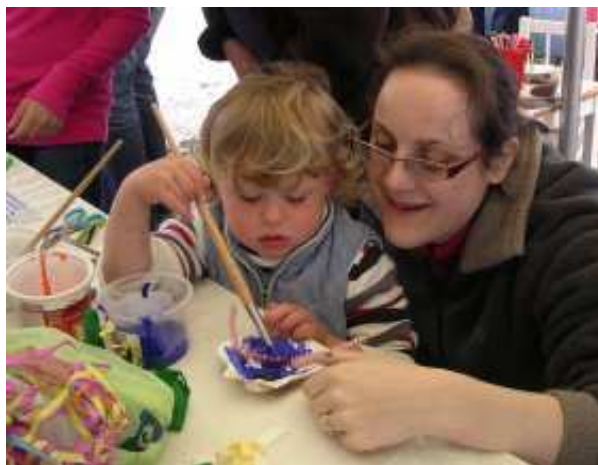
Enjoying the crafts at Solway Firth Partnership's stand