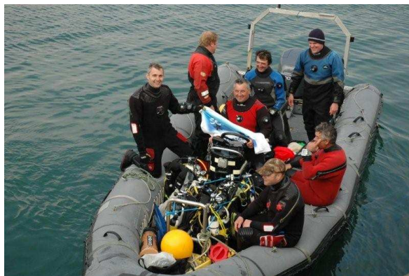
Newton Stewart British Sub Aqua Club set out for their SeaSearch training dives