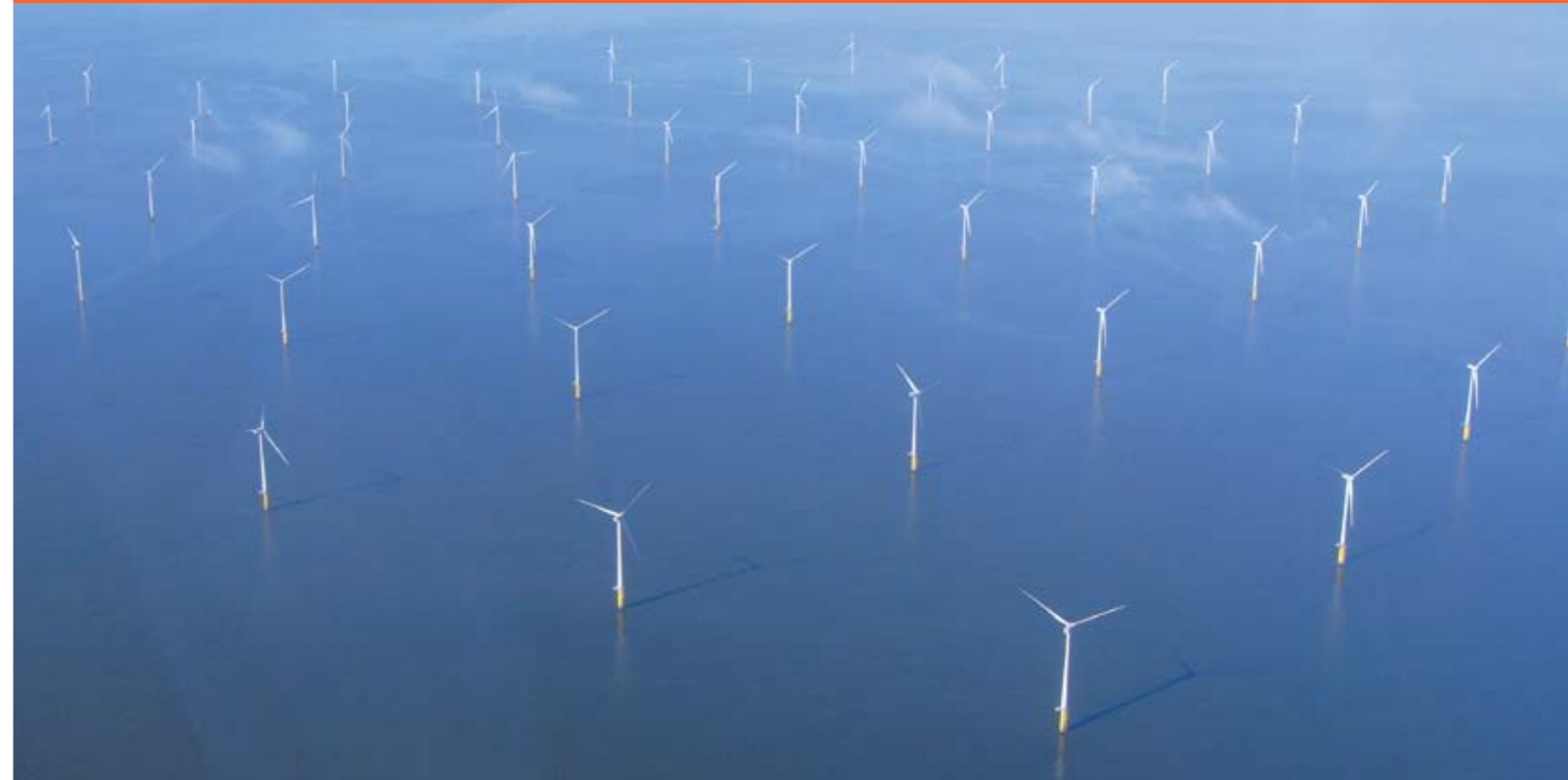
Robin Rigg Offshore Wind Farm