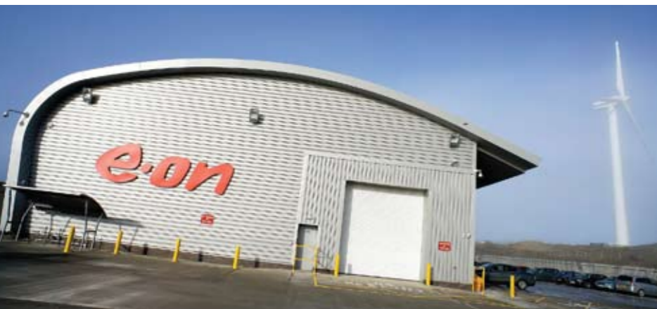
Robin Rigg Operations and Maintenance building, Port of Worthington

solwayheritage.co.uk cumbriafoundation.org